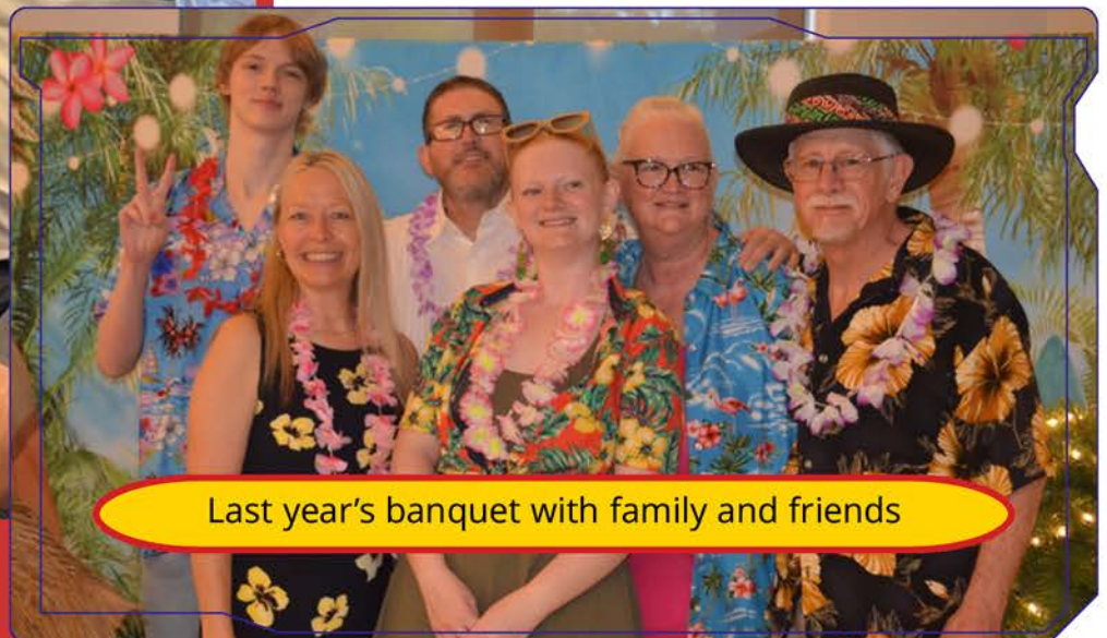
Last year’s banquet with family and friends